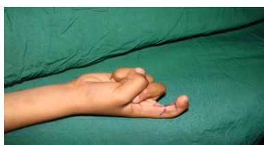
B) Released with four flap Z-plasty.