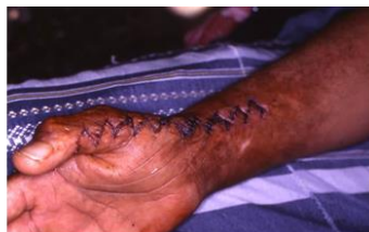
B) managed by release with multiple Z-plasty.