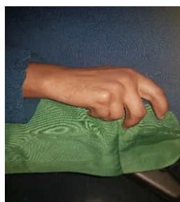
A & B) Rt post-burn contracture of volar surface of index to little fingers.