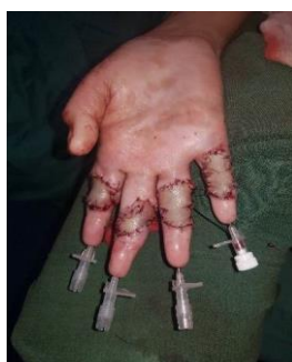
B) release of contractures and coverage by FTSG with wire fixation.