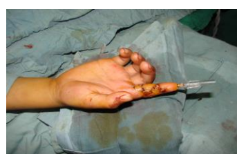
C) Stabilized with wire fixation.