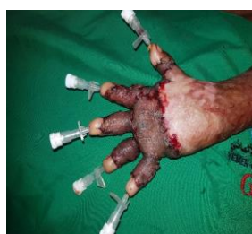
E) Rt hand after release and coverage with STSG and wire fixation.