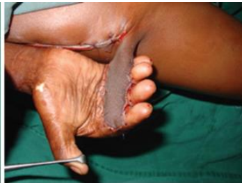
B) Release is done and resurfaced with Groin flap.