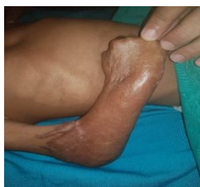
A) post-burn contracted right hand & elbow.