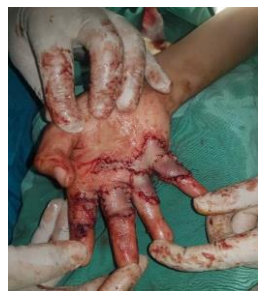
C) release of contractures and coverage by FTSG.