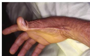
A) post-burn scar contracture for Rt distal arm, wrist and thumb.