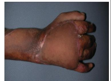
B) contracture release is done and covered with distally based radial forearm flap.