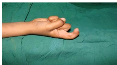
A) post-burn contracture of Rt index volar surface.