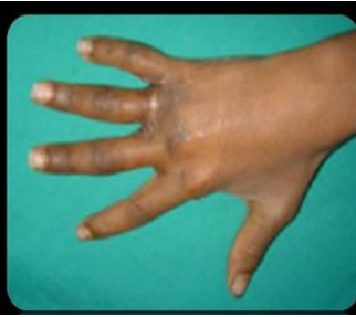
B) Post release of contracture with coverage by square flaps.