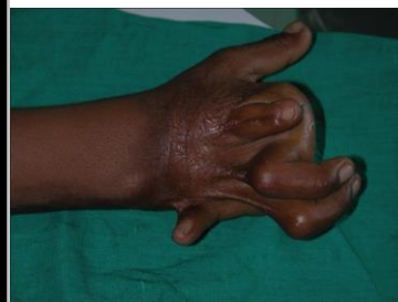
A) Severe Rt dorsal hand contracture.