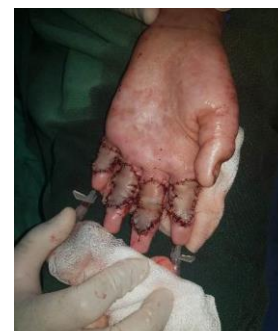
D) Release of contractures and coverage by FTSG with wire fixation.