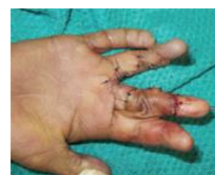
B) Release for ring finger by multiple Z-plasty & middle finger released & resurface by cross finger flap from dorsum of index finger.