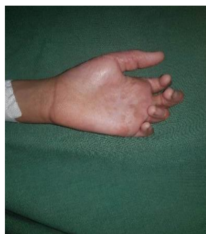
C) Lt post-burn contracture of volar surface of index to little fingers.