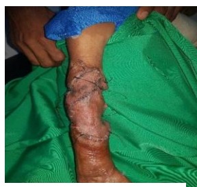
C) Release of right elbow with STSG.