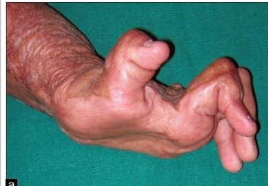
A) Severe dorsal contracture of the Lt hand.