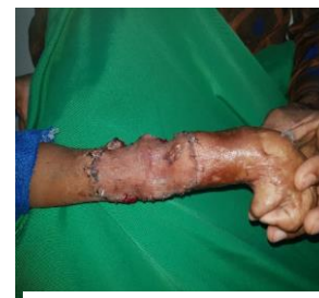
D) Release of left elbow with STSG.