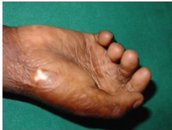
A) Post-burn contracture of volar aspect of Rt index to little fingers.