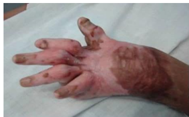
A) post-burn scar contracture of dorsal hand and fingers.