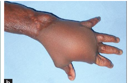
B) After release, the dorsal hand resurfaced with abdominal flap.

The hands account for less than 5% of TBSA (2), but loss of the hand constitutes a 57% loss of function for the whole person [8,9]. Whether the burned hand is an isolated injury or part of a large total body surface area burn, its loss represents a major functional impairment [10]. Treatment of the hands receives high priority because the patient's ability to perform useful work after recovery is to a great degree determined by residual hand function. The functional importance of the hand cannot be overemphasized in as much as severe hand burns may leave individuals unable to work or even care for themselves [5]. Post-burn contractures are common and severe in developing countries as our society and are a