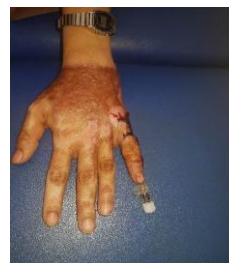
B & C) Contracture release with FTSG coverage and wire fixation.