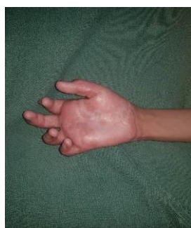
A) Rt post-burn contracture of volar surface of index to little fingers.