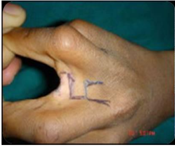
A) Post burn contracture of 2nd to 4th web spaces.