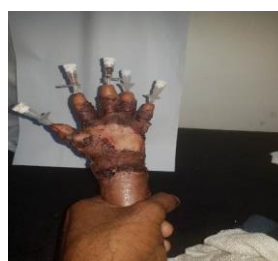
F) Lt hand after release and coverage with STSG and wire fixation.