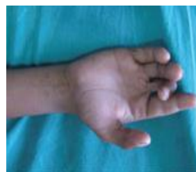
A) Post-electrical burn right middle and ring finger.