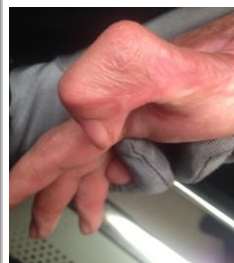
A) Contracture of left little finger volar surface.