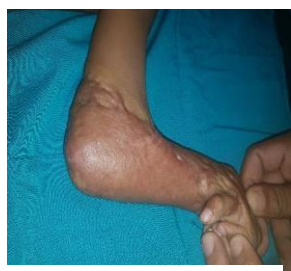
B) post-burn contracted left hand & elbow.